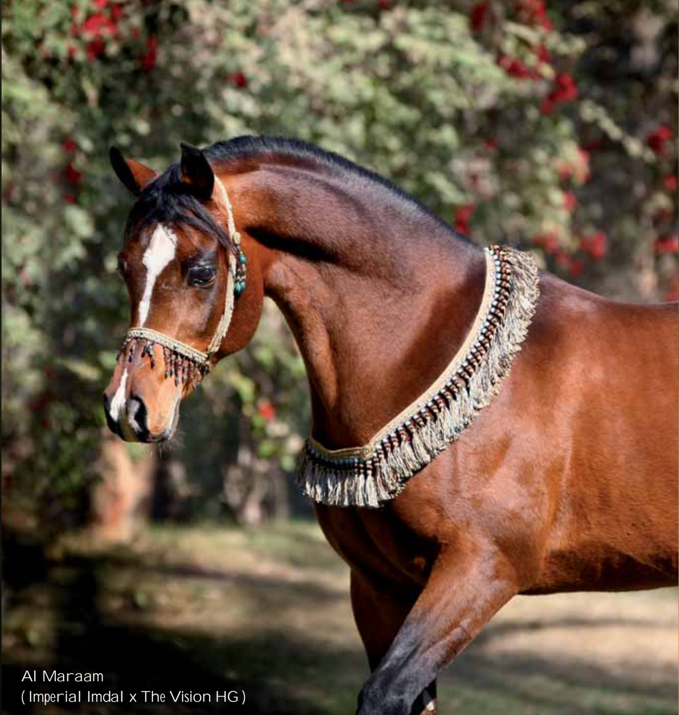
Al Maraam ( Imperial Imdal x The Vision HG )

I believe that this is exactly what I have been able to achieve in the last 20 years and I must say that I am very gratified at what I have been able to accomplish to date. Having said that, I must add that I am trying always to evolve and remain dynamic in my thinking. In order to do this I had to eliminate certain individuals and sometimes lines all together. In order to reach some of my goals, I have used outside stallions, acquired new mares and attempted to reach the vision of what I wanted to attain.