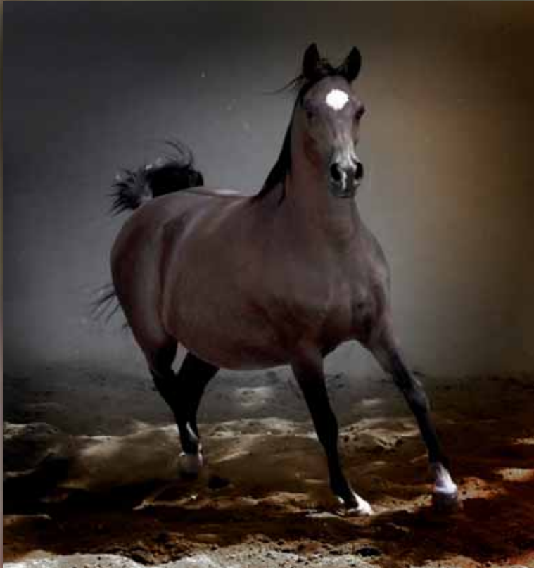
Sondos Albadeia (Farid Albadeia x Mahasen Albadeia)