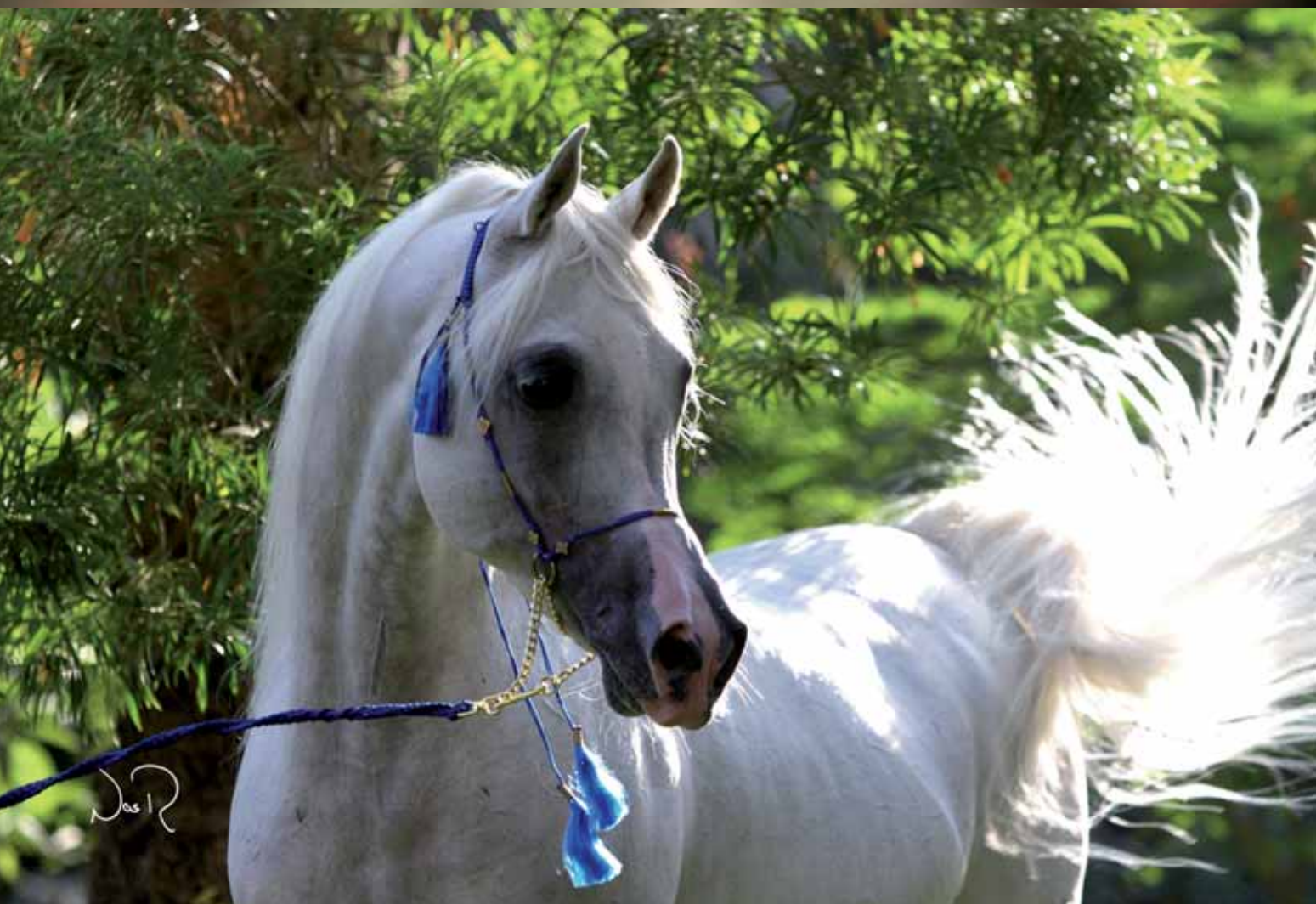
Laheeb ( Imperial Imdal x AK Latifa )

PC: What are the major influences on your planning? How do you incorporate your individual vision of how the horse should look and move?