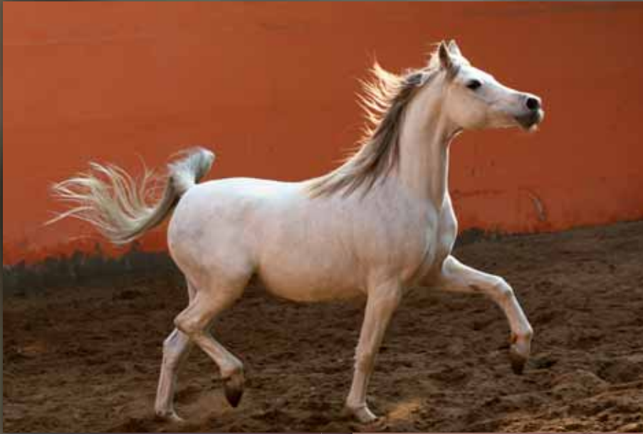
Kamarain (Inshallah Albadeia x Kamar Albadeia)