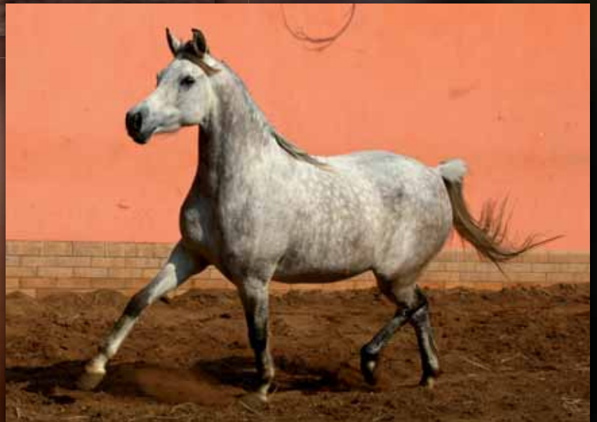
Bahga Albadeia (Nagham Albadeia x Zaghroudat Albadeia)