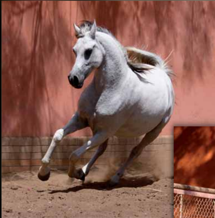
Isaad Albadeia (Jafaar Albadeia x Zaghroudat Albadeia)