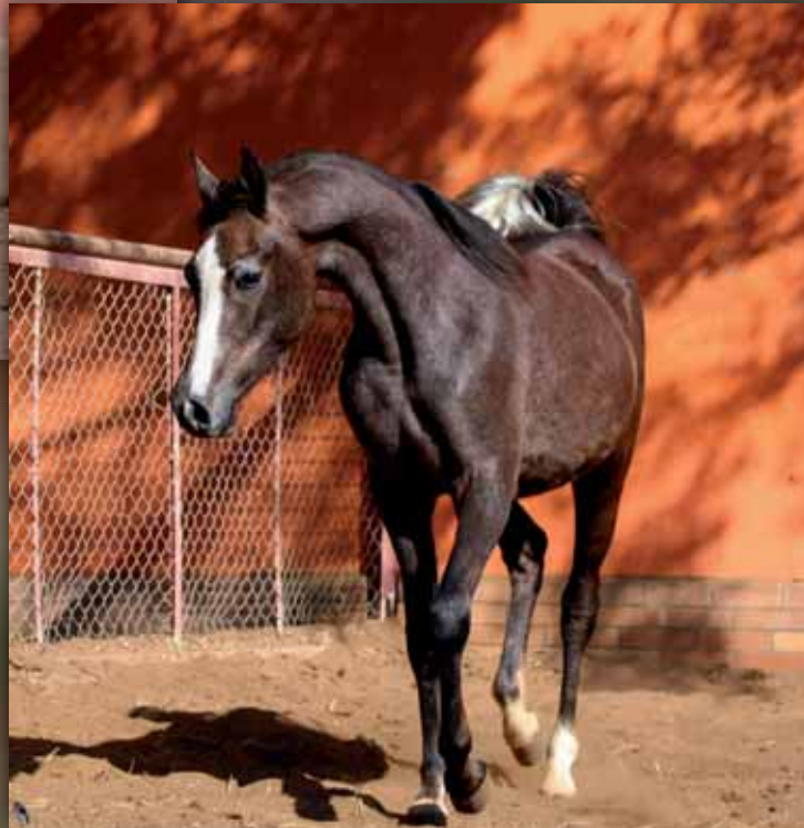
Zahda (Laheeb x Isaad Albadeia)

PC: Economic conditions are changing throughout the world. How are you tailoring your program to deal with these changes and what can you suggest for some other breeders to consider?