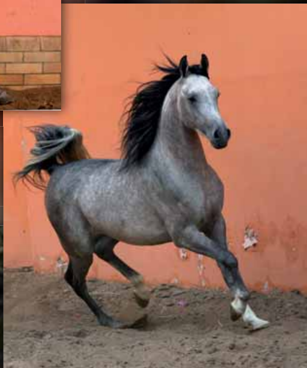
Gamehh Albadeia (Simeon Sharav x Bashoosha Albadeia)