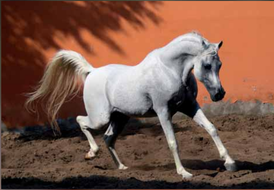
Zaghroudat Albadeia (Adl x Kamar Albadeia)