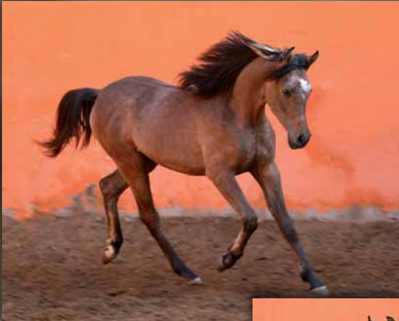
Tarheeb Albadeia (Laheeb x Bahga Albadeia)