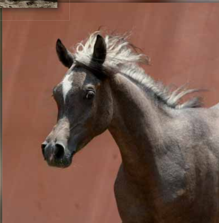
Tameem Albadeia (Laheeb x Tamimat Albadeia)