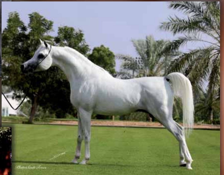
Tammam Albadeia (Simeon Sharav x Tamimat Albadeia)