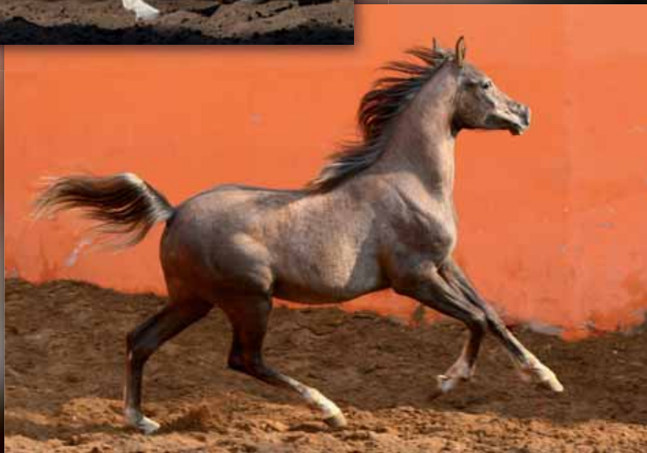
Mohab Albadeia (Laheeb x Zaghroudat Albadeia)