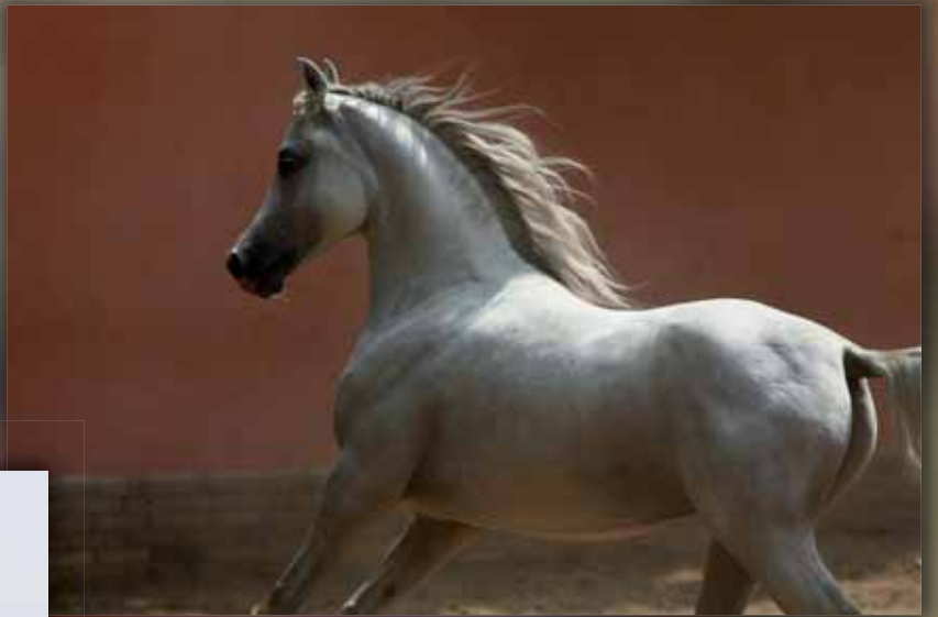
Saheel Albadeia (Simeon Sharav x Sahlallah Albadeia)