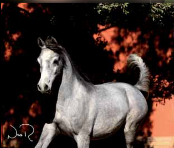
Tarneemat Albadeia (Simeon Sharav x Tamimat Albadeia)