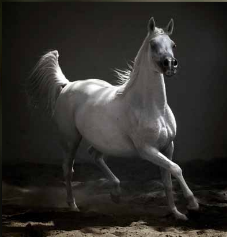
Tamimat Albadeia (Bar Sama Halim x Aneesat Albadeia)