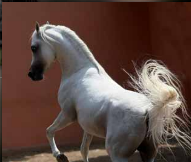
Ghaith Albadeia (Simeon Sharav x Tamimat Albadeia)