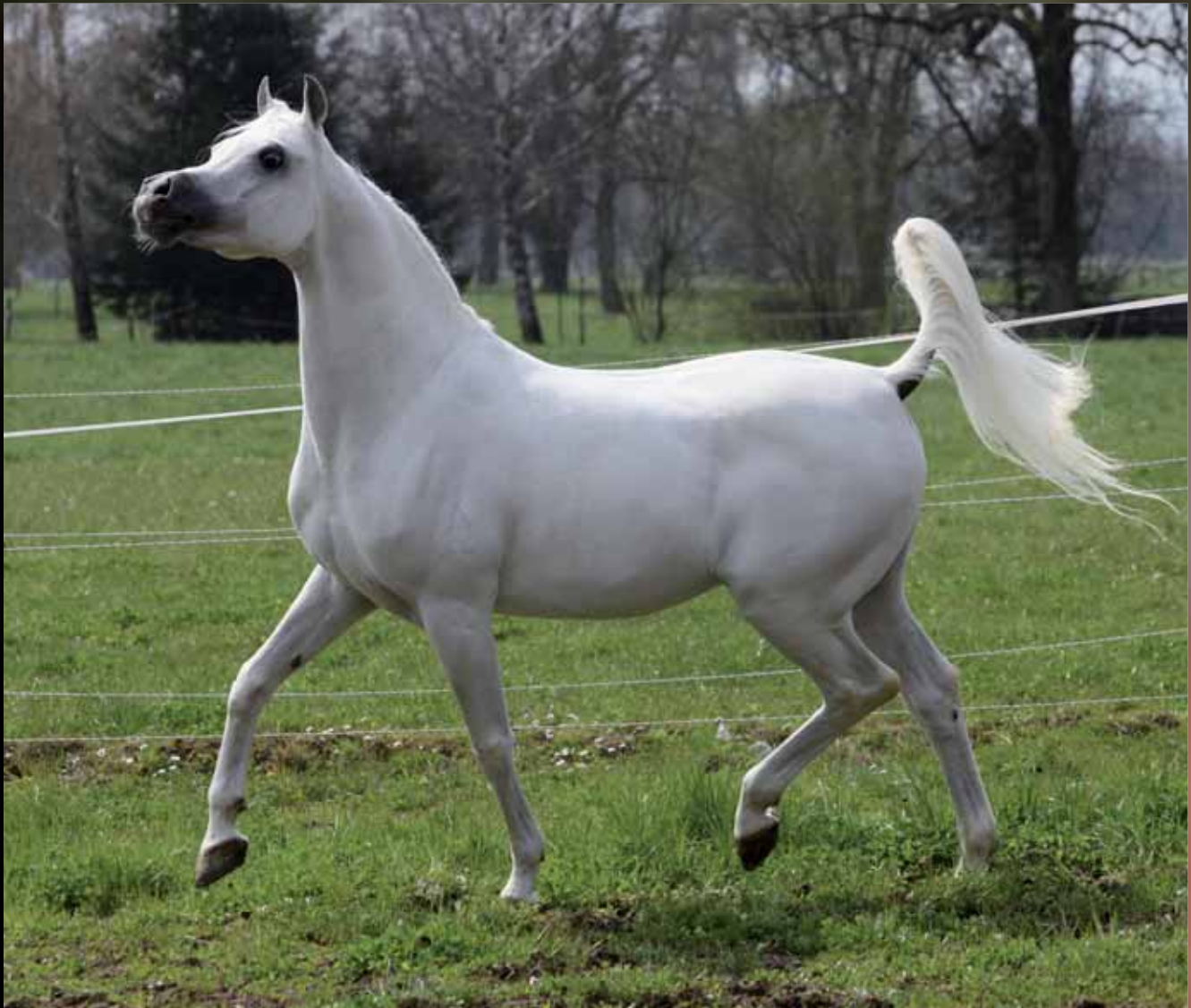
Simeon Sharav ( Asfour x Simeon Shuala )