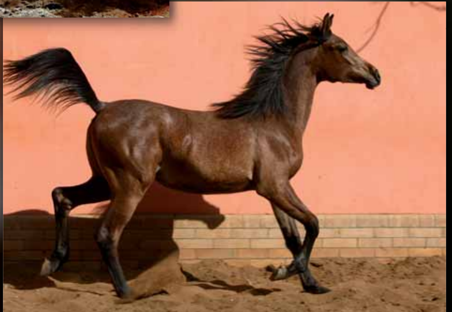
Amnah Albadeia (Laheeb x Sondos Albadeia)