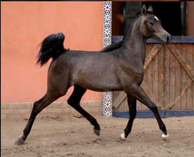
Lahlouba Albadeia (Laheeb x Hekayet Albadeia)

widen the pool from which I match them with what I think is the best stallion. All of my broodmares are important to the breeding program. I do not prefer one over the other.