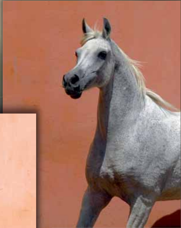
Asfourat Albadeia (Farid Albadeia x Simeon Safir)